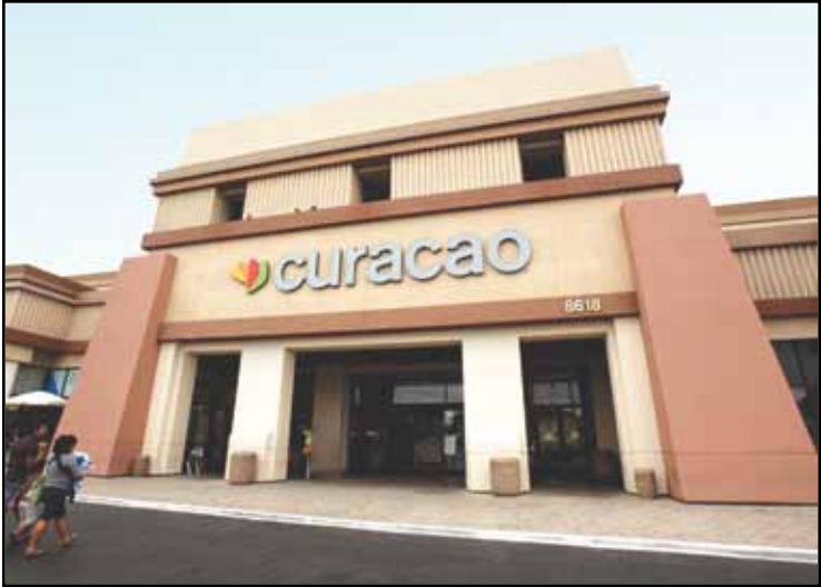
Investigators say Curacao targeted low-income and undocumented immigrants, baiting them with false advertising and adding items and services to their contracts without consent.