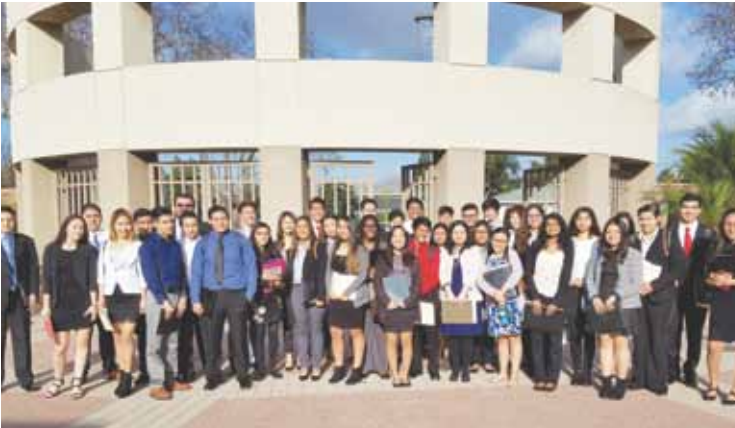
Norwalk High School Students arriving for their Mock Interview Session.

The 2nd Annual Student Mock Interviews were held on February 22nd at the Norwalk Arts & Sports Complex by the Norwalk Education Alliance (NEA). The NEA is a partnership with the City of Norwalk, Norwalk Chamber of Commerce, Cerritos College, SELACO Workforce Development Board, Norwalk La Mirada USD and Santa Fe Springs High School. All of these organizations have come together to support the City of Norwalk's 2020 strategic plan to raise the education and earning level of citizens of Norwalk. Students from local high schools spent time in the classroom learning a variety of interview and resume skills which they were able to use in a practice interview or mock interview with a business or education professional. Each student prepared a job application and practiced for the interview as if it were a real one. Dressing in their interview attire, bringing their resumes and meeting with the interviewers each student was able to have a real life experience that will help them in their future employment.