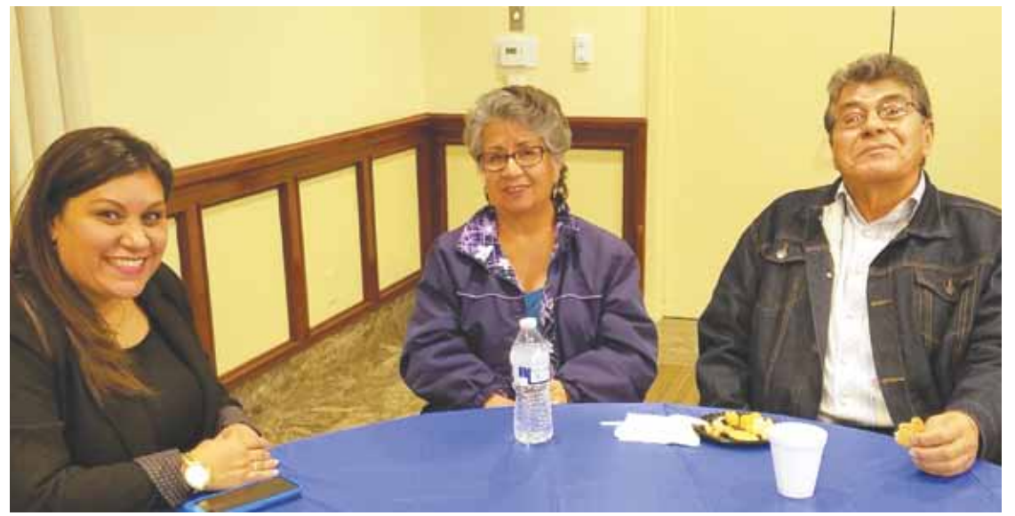
Norwalk Residents attend the Chamber's Candidates Meet & Greet to find out more about each candidate before the March 7th election.