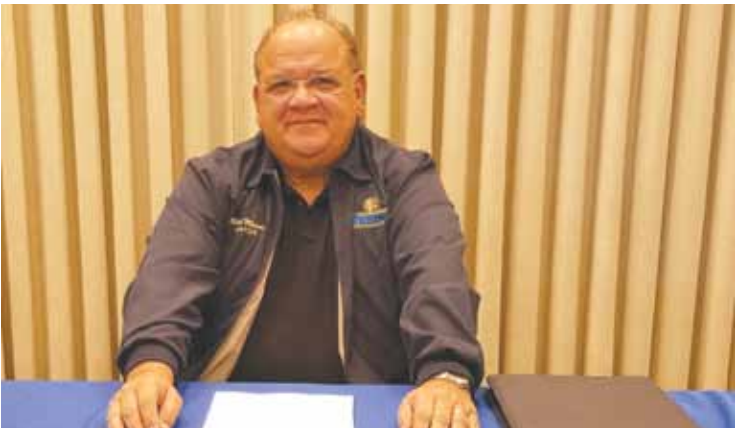
Norwalk Mayor Mike Mendez participates in the NEA Mock Interviews.