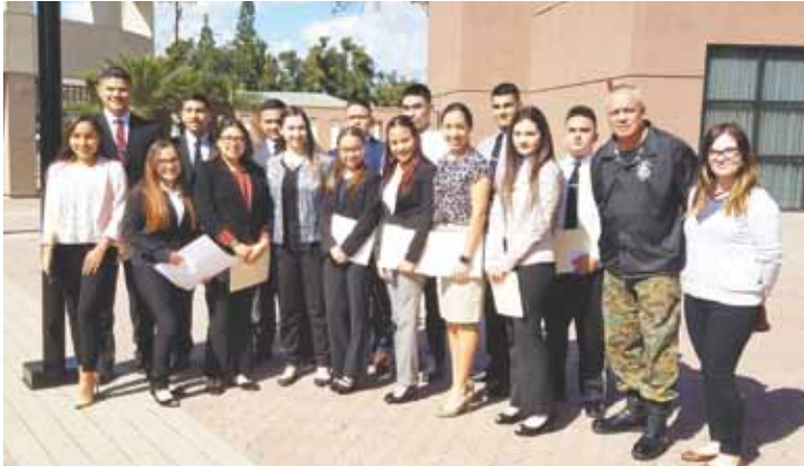
Southeast ROP Academy Students getting ready for Mock Interviews.