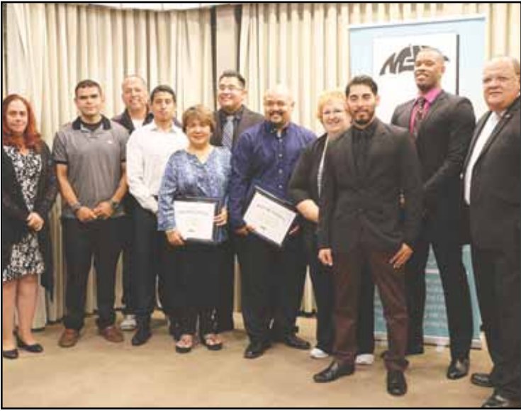
The Norwalk Coordinating Council held its annual scholarships award dinner at the Norwalk Arts & Sports Complex on Oct. 26, awarding thousands of dollars in scholarships to young veterans at Cerritos College.