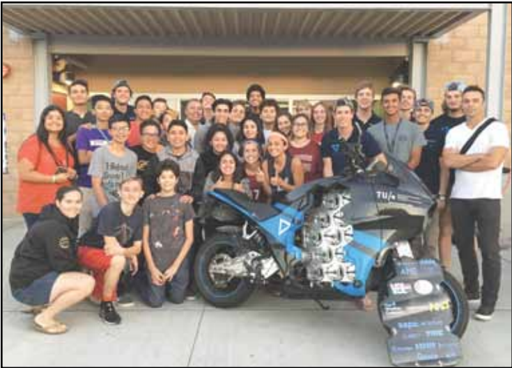
DOWNEY – STORM Wave, the electric motorcycle designed by STORM Eindhoven, a team of 24 Dutch students at Eindhoven University of Technology, rode into Downey this week as part of their 80-day world tour.

The goal of the journey is to show the potential of e-mobility worldwide. The team was in Los Angeles, where they visited various events, including a meeting with the Dutch Honorary Consul at the VTBS Architects Office, Downey High School’s Engineering Department, and a group of local creatives at Stay Gallery.