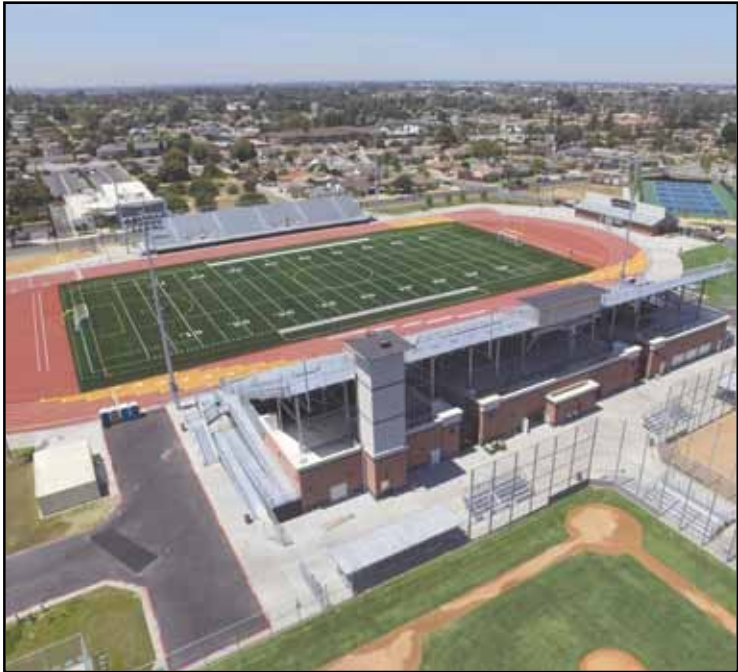
The new $20 million stadium at Cal High will be the home stadium for California, Whittier and La Serna high schools.

During the celebration, visitors toured the stadium, which will be shared among California, La Serna and Whittier high schools, and saw firsthand the many improvements it will offer to the school community, including enhanced seating capacity – with 2,000 seats for visitors and 5,000 seats for the home team – and upgrades that include an all-weather track, renovated soccer fields, outdoor