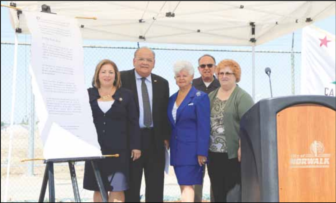
Rep. Linda Sanchez, Mayor Mike Mendez, and Rep. Grace Napolitano celebrate with Norwalk Councilman Luigi Vernola and Vice Mayor Cheri Kelley just after signing over 15 acres of land to the city of Norwalk at no cost.

NORWALK – Norwalk city and regional leaders celebrated the free transfer of 15 acres of land from the U.S. Air Force on Tuesday, promising the robust property will provide for a long-awaited expansion of Holifield Park.