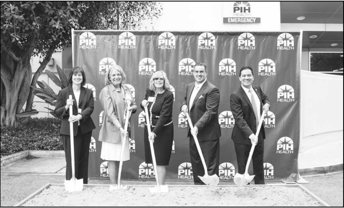
Hospital and city officials held a ceremonial groundbreaking Aug. 5 to mark the start of construction at PIH Health in Downey, which is expanding its emergency room.