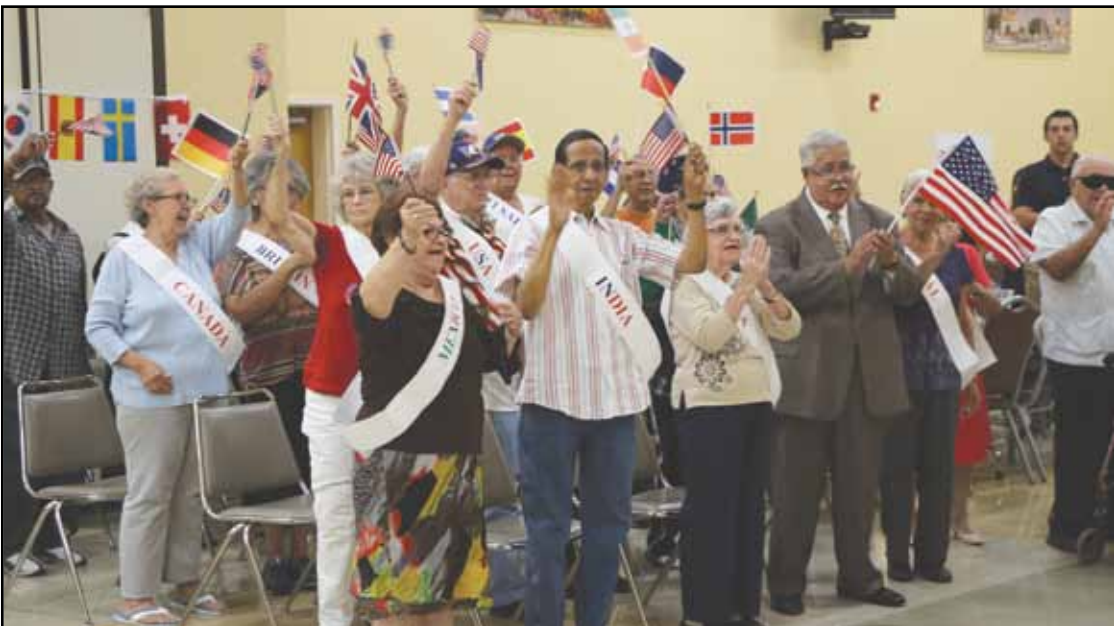
Norwalk seniors cheer on sports games during the city's Summer Lobby Olympics, which started last Friday and ends Friday, Aug. 19. The event is free and open to individuals 50 years of age and older. Opportunity raffles are also available at the end of each game.