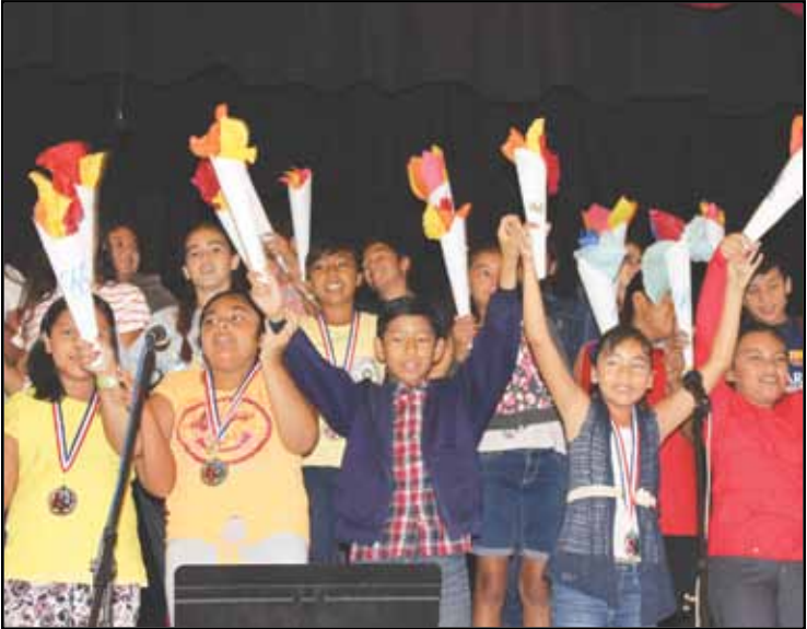
Norwalk-La Mirada Unified’s migrant education students hold Olympic torches high in the air while singing “Hand in Hand” during a showcase performance held at Edmondson Elementary School.

Students have been able to enroll in the migrant education program for more than 20 years. NLMUSD