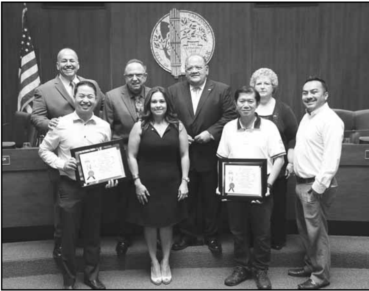
The Norwalk City Council on Tuesday honored businesses in the city of Norwalk for participating in Helpline Youth Counseling's "Merchant Committed" Program.

The Norwalk Patriot 8/5/16, 8/12/16, 8/19/16