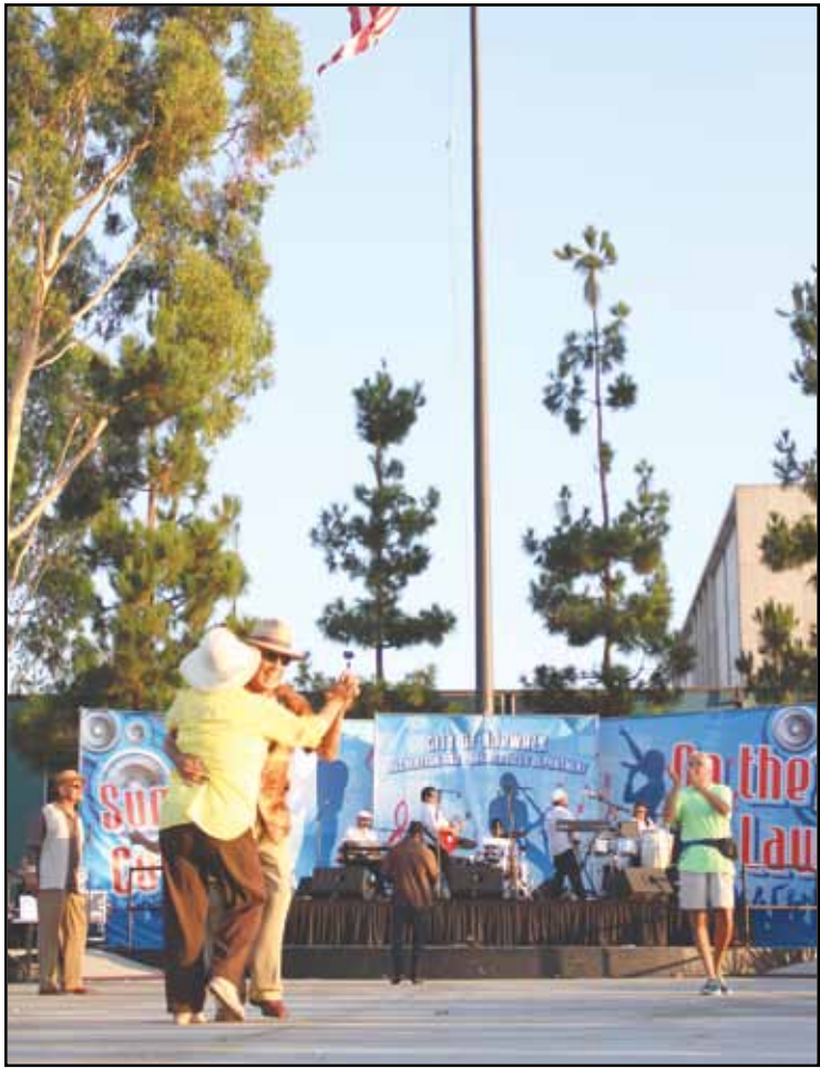
Hundreds of Norwalk residents gathered on the Civic Center Lawn Wednesday night to stand up against crime and celebrate summer during the annual ‘National Night Out’ and Summer Concert Series.

Each August, communities across the country come together to support local crime prevention while building police-community partnerships to enhance safety and improve quality of life.