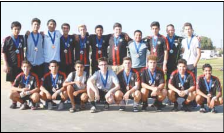
The Downey AYSO BU16 Travel Team played in the annual Cypress Soccer Tournament over Memorial Day weekend.