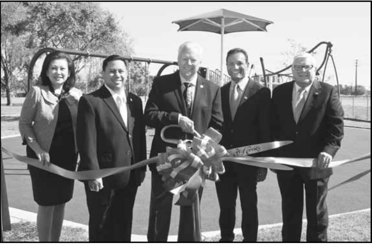
The Cerritos City Council recently held a ribbon cutting ceremony to commemorate new playground improvements at Liberty Park. The playground received new climbers, interactive elements, slides and swings. New playground surfacing also was installed. A color palette of various shades of blue was selected for the playground.

The new principals will be recognized during the Whittier Union Board of Trustees meeting at 7 p.m. Tuesday, June 7.